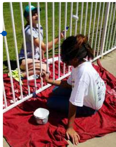
Teens from the Interact Club got into the act at Hope House on ‘Rotarians at Work Day.’

This was year extra special since for the first time, it was a multi-generational affair. Members from the Interact Club (Rotary’s teen club) also participated. The Interact Club also came out in force for the Angel View Prom, sponsored by Rotary (see story page 6–7).